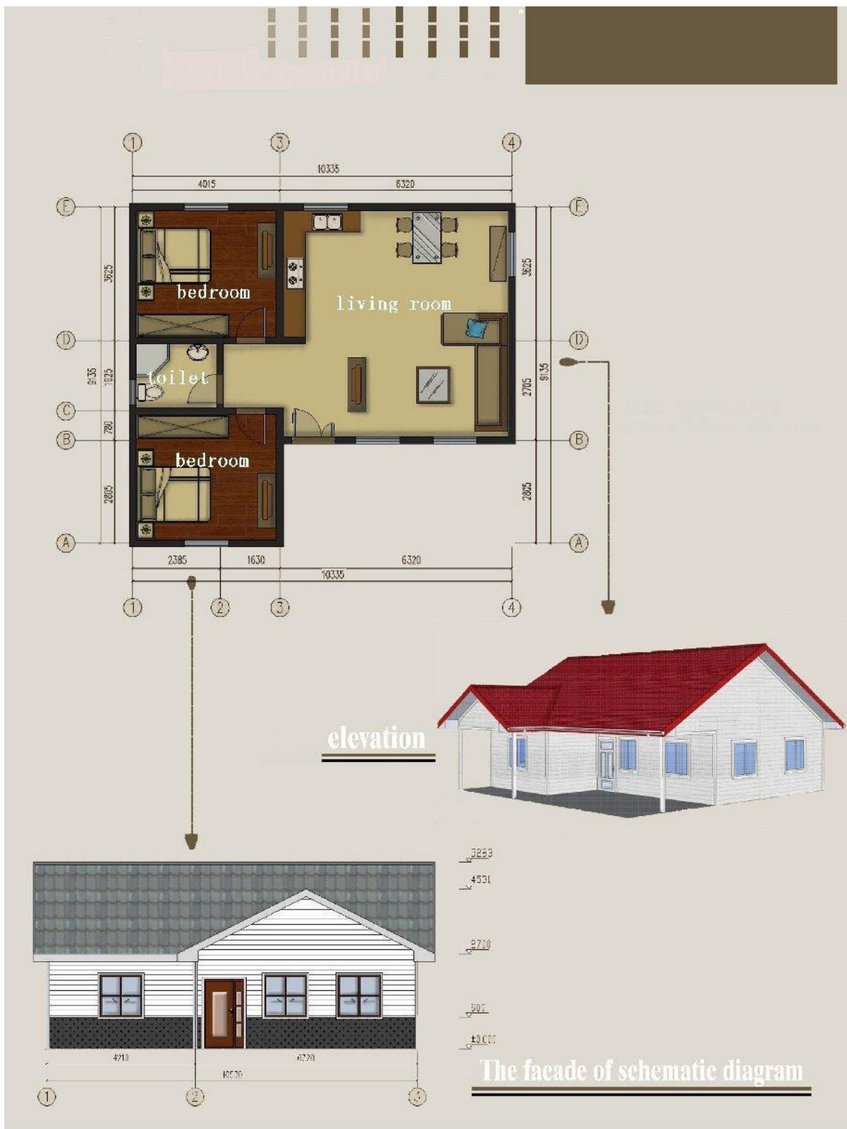
The facade of schematic diagram

The layout for the Prefabricated House No -03 = 96 m 2 . This house is supplied with all services that are electrical and plumbing systems along with a choice of furniture and kitchen and bathroom units that can be constructed in a period 10 to 12 days after the concrete foundation is cast and ready for the house structure to be installed at the designated location.