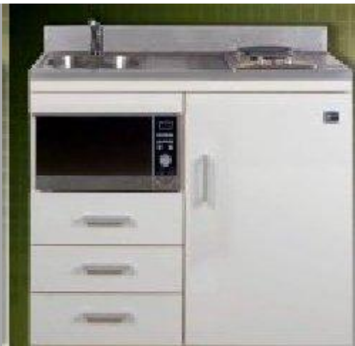
White with drawers - B