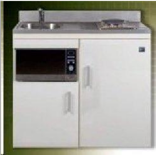
White with cupboard - A

(H91,5 cm x D60 cm x W103 cm) is an equally advanced model as the 103-1, and has a larger freezer, left side of the unit contains either 3 drawers or 1 cupboard.