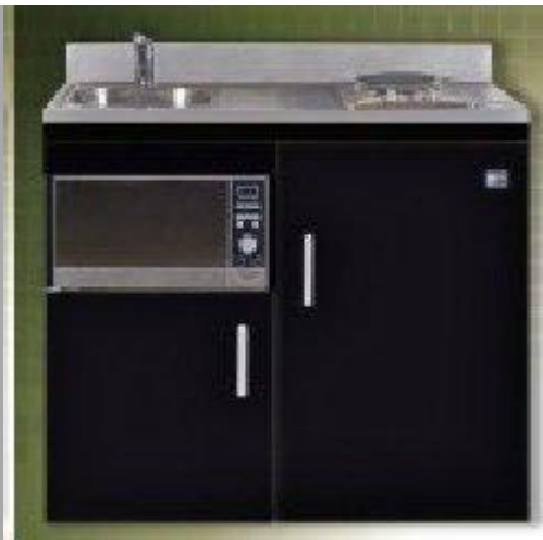
Black with cupboard - A