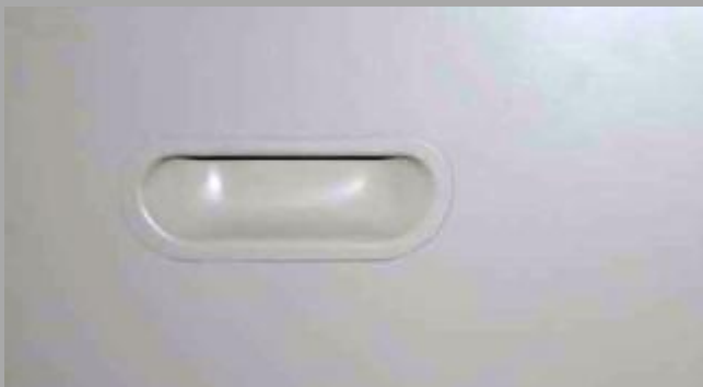
Practical handles on sides

We supply MK 766 in white, and MK 103-11 & 22 in black & white. These colours can be changed to any of the choices in the picture on a minimum order of one forty ft container