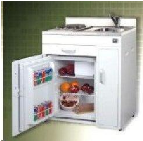
Fridge with Door Opened