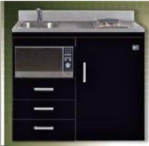
Black with drawers - B