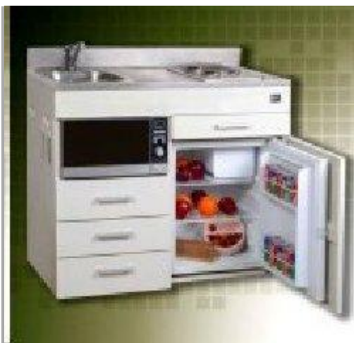
White with drawers - B