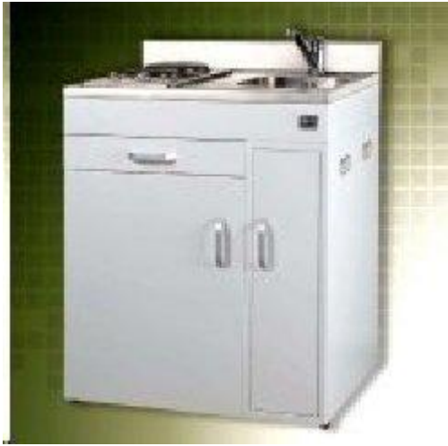
Fridge with Door Closed

(H-91,5 cm x D-60 cm x W-76 cm) This is the basic model and contains a fridge with a freezer, one cooking hob, a sink with water tap, a cutlery drawer with cupboard for storing kitchen items.