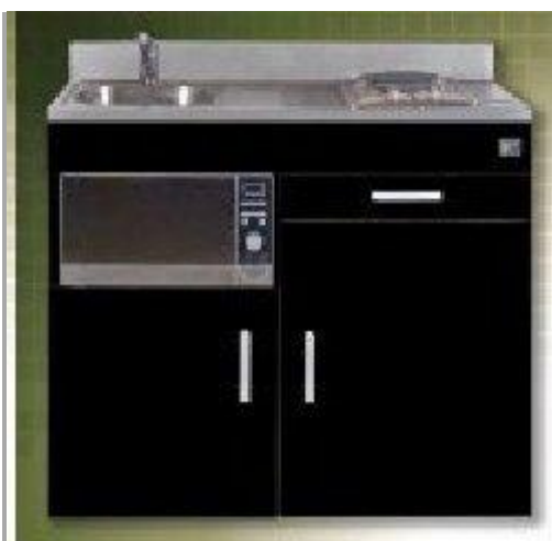
Black with cupboard - A